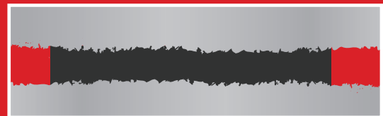
Same view with a gasket