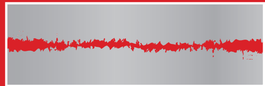
Microscopic view of components in contact without a gasket

The material that is best suited for a particular gasket depends on the temperature, pressure, fluid, and chemicals to which the gasket will be exposed during operation. Our experienced engineers will help you select exactly the right material for your situation, and manufacture the gasket to your specifications that same day.